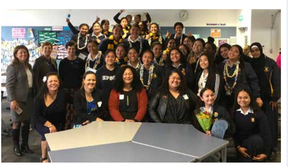
Pacific Futures celebration held on 24 September 2019

Senior students have been receiving valuable feedback this week, from the school examinations. Over the holidays they should plan to spend some of the time having a complete break, and then some of the time to starting their preparations for the final lead-up to the November NCEA External Examinations. The proportions will be different from person to person. Senior students should also know that it is normal and expected for their social lives to reduce over the next vital weeks. For Year 13 students this is especially important as they move closer to realising their hopes for results that will make next steps possible. The message is clear and simple – there is enough time to give revision and study the time and attention they need and deserve in order to have no regrets later. Planning your time is crucial and then actually getting on and doing the work, putting effort in that will advantage you.