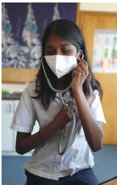
Year 12 biology learn about the circulatory system