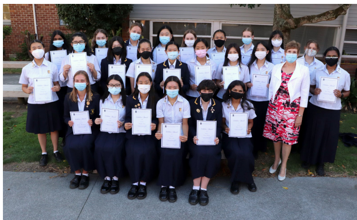
2021 Level 2 Scholars

On Tuesday 2 March we celebrated the achievements of our senior students from 2021 with our online Scholars Assembly. We also recognised the outstanding success EGGs has had in NZ Scholarship for 2021.