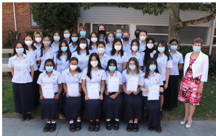
2021 Level 1 Scholars