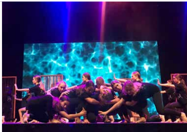
Show Quest 2019 - Congratulations - 2nd place overall