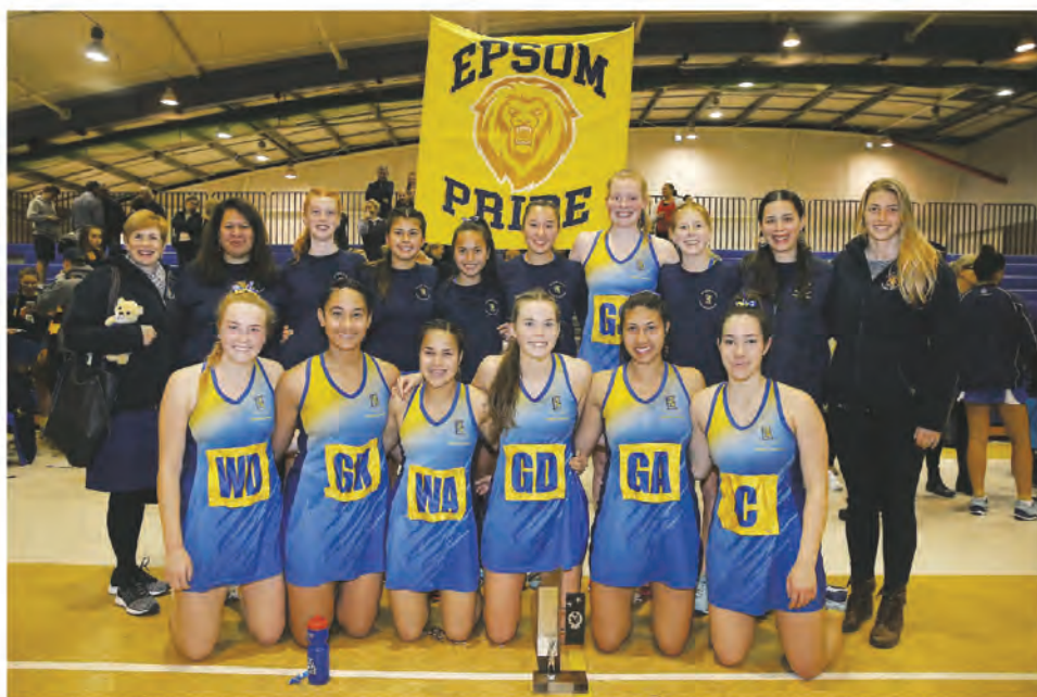
EPSOM PREMIER NETBALL TEAM Winners of the Auckland Secondary Schools Premier Grade & UNISS 2018