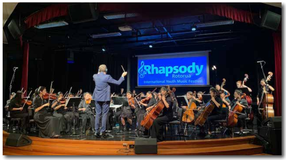
Epsom Symphonia (Synthony performance) at the Rhapsody Rotorua Music Festival