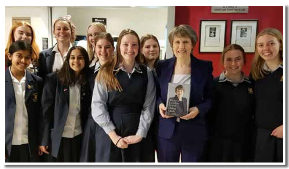
Former Prime Minister Helen Clark with students and her new book Women, Equality, Power at the second function in this series - Women in Politics - held on 29th August at the RFAC. All funds raised from the events will go towards the L Block redevelopment project.