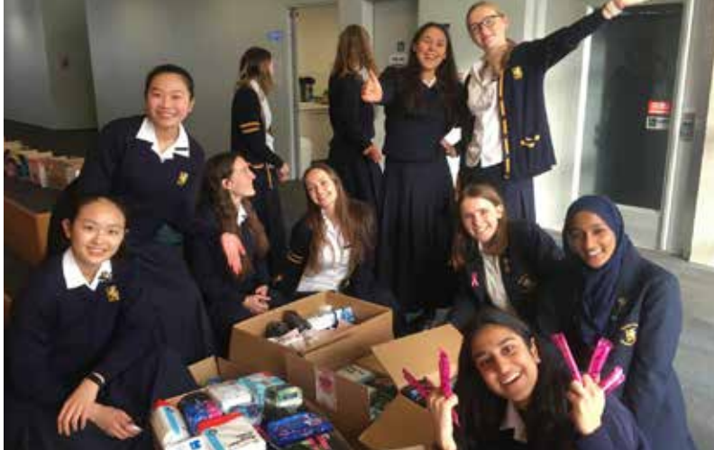
Community Leaders collecting the donations

The Community EGG hosted a school-wide Sanitary Drive in the final two weeks of Term Two. The event sought to raise awareness about the widespread issue and implications of Period Poverty in New Zealand. The event was a great success as it encouraged many discussions throughout the school community and resulted in over 400 boxed items and 500 single items being collected. Early this term, we delivered the donations that our school collected to the Auckland City Mission Distribution Centre in Grafton. They were so grateful and excited to receive our donations, and it was a great ending to such a successful event.