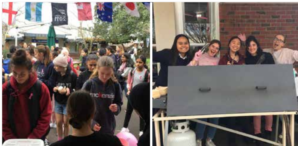
Community EGG International Food Court - raising funds for the Breast Cancer Foundation