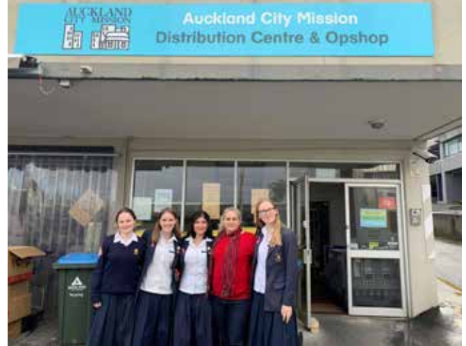
Community Prefects dropping off donations