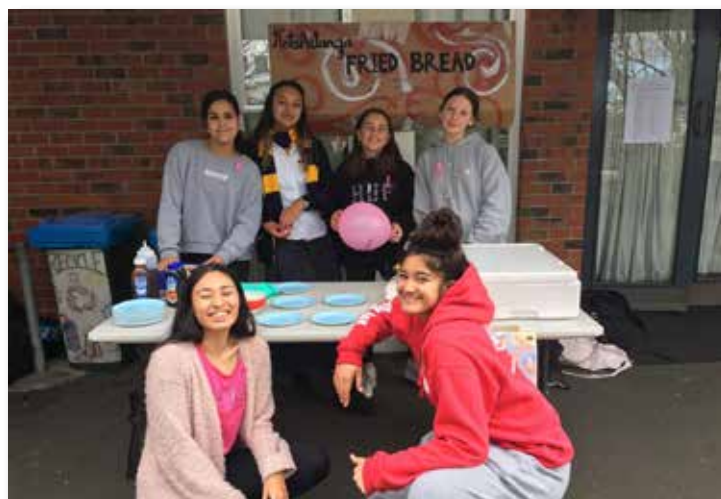
Kotahitanga Committee selling fried bread

On Friday 28th of June, the Community EGG held an International Food Court for Epsom students and staff. The event was a tremendous success, with the area outside the hall packed and all food sold out within twenty minutes. On the menu were dumplings, churros, bubble tea, pan au chocolat and fried bread. We were all sold out halfway before lunch. The Community EGG had lots of fun organizing this event and hope to see it continued next year. The profits from the event will be donated to the Breast Cancer Foundation along with the money raised by the Student Council on their Mufti Day.