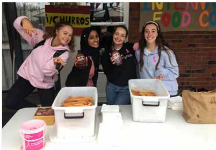
Community Leaders selling Churros