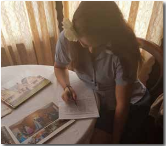
Students at Highwic House