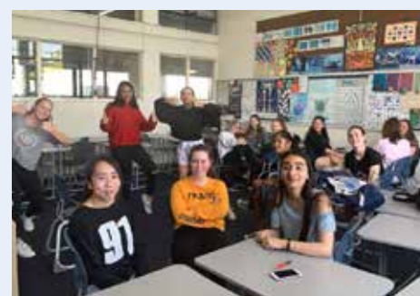
Year 12 Leadership training