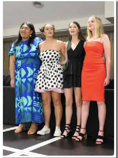
2018 Head Prefects