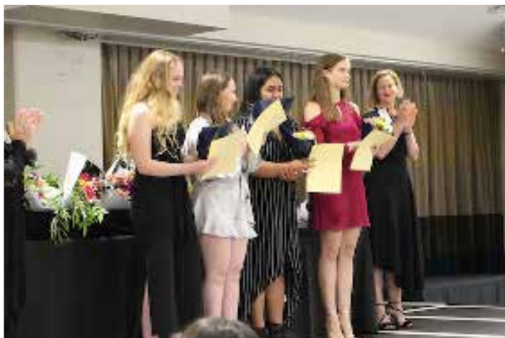
OGA Scholarship recipients