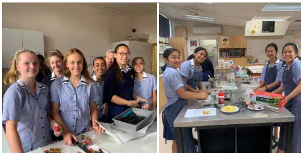
Year 9 - Community Aroha Day

Last Thursday was the Graduation Dinner where students, parents, and staff celebrated the Year 13 leavers. This event is hosted by the Old Girls Association and it was a wonderful occasion. Friday was the Year 9 Community Aroha Day and the Year 10 Careers Day; today the Year 10 Ki o Rahi Tournament and the Year 9 Pop-up Globe Trip to Taming of the Shrew. As well as a busy Junior School programme we have also had the Senior Student Leadership Training Days running.