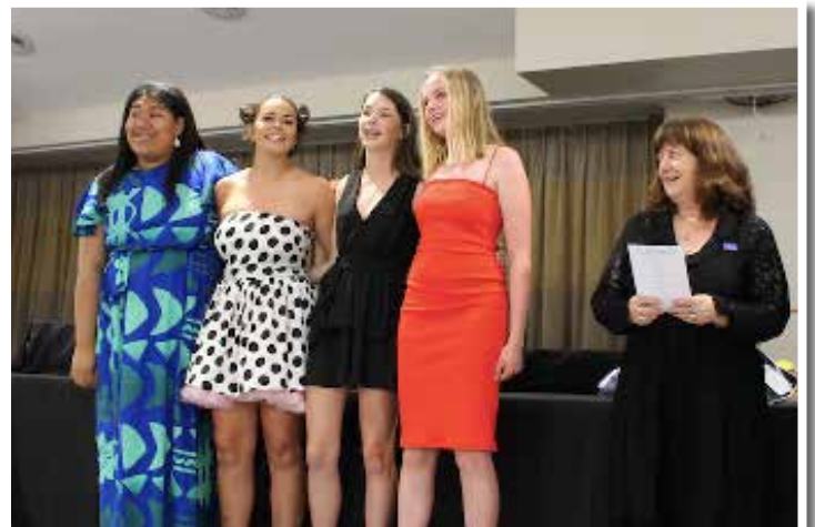
Singing the School Song....