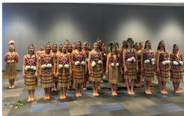
Kapa Haka rōpū perform at Polyfest