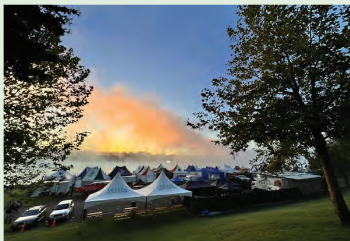
Mornings at Aon Maadi Regatta Lake Karapiro