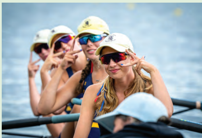
15 4+ posing for a picture at the start line