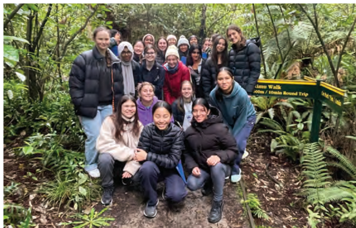
Year 12 Geography trip - page 5