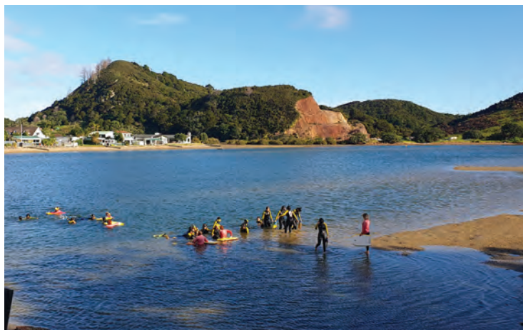
Year 10 Camp, Pataua South - more photos on page 4