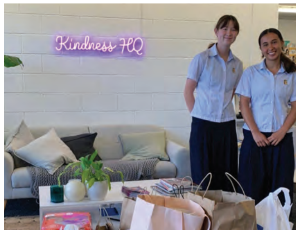
Flood Drive - details on page 2