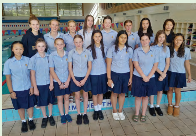
Central Zone Swim team