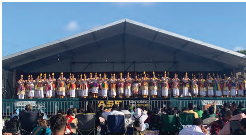
Tongan Cultural group at Polyfest 2023 - details on page 6