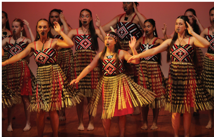
Fia Fia Night - more photos on Page 6