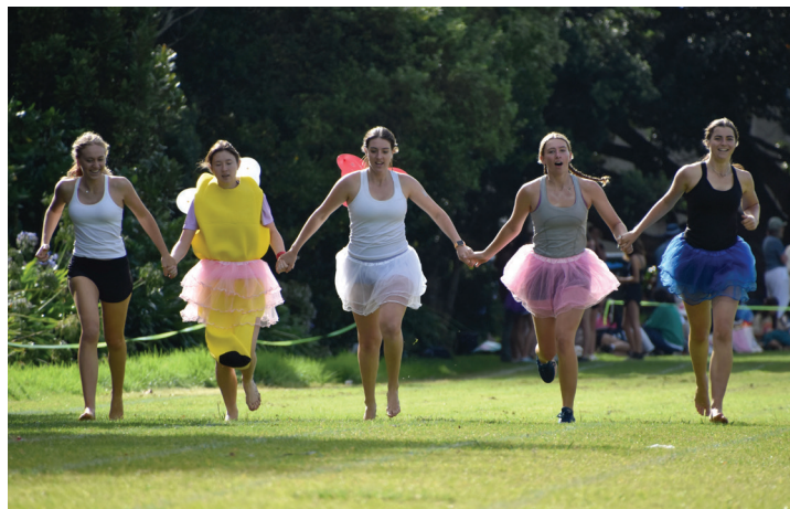
Athletics Day - more photos on Page 7