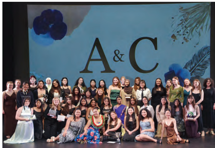
Arts & Cultural Awards - Page 5