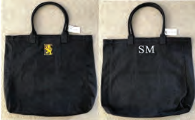
Charcoal (embroidered example)