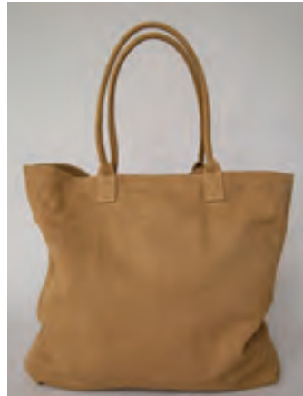
(colour samples only)

There are 4 colours to choose from and then you can choose from a selection of colours to embroider your initials, nickname, first or last name.