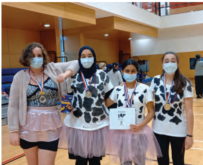
Oh la vache!

On Thursday night 16 June, St Mary's College hosted the first Senior French Quiz Night since 2018. 12 teams of 4-6 students in Years 12 and 13 competed in 9 rounds and various other competitions throughout the night.