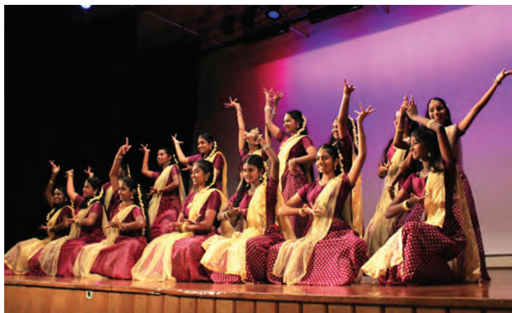
Fia Fia Night - for more pictures see pages 12-13