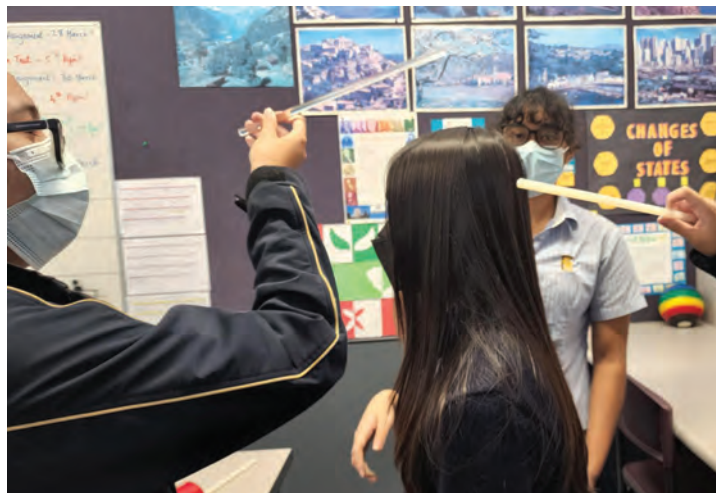
Year 11 Physics fun with electricity