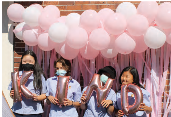
Kindness Week held at the end of Term 1