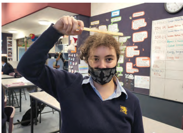
Year 11 Physics fun with electricity