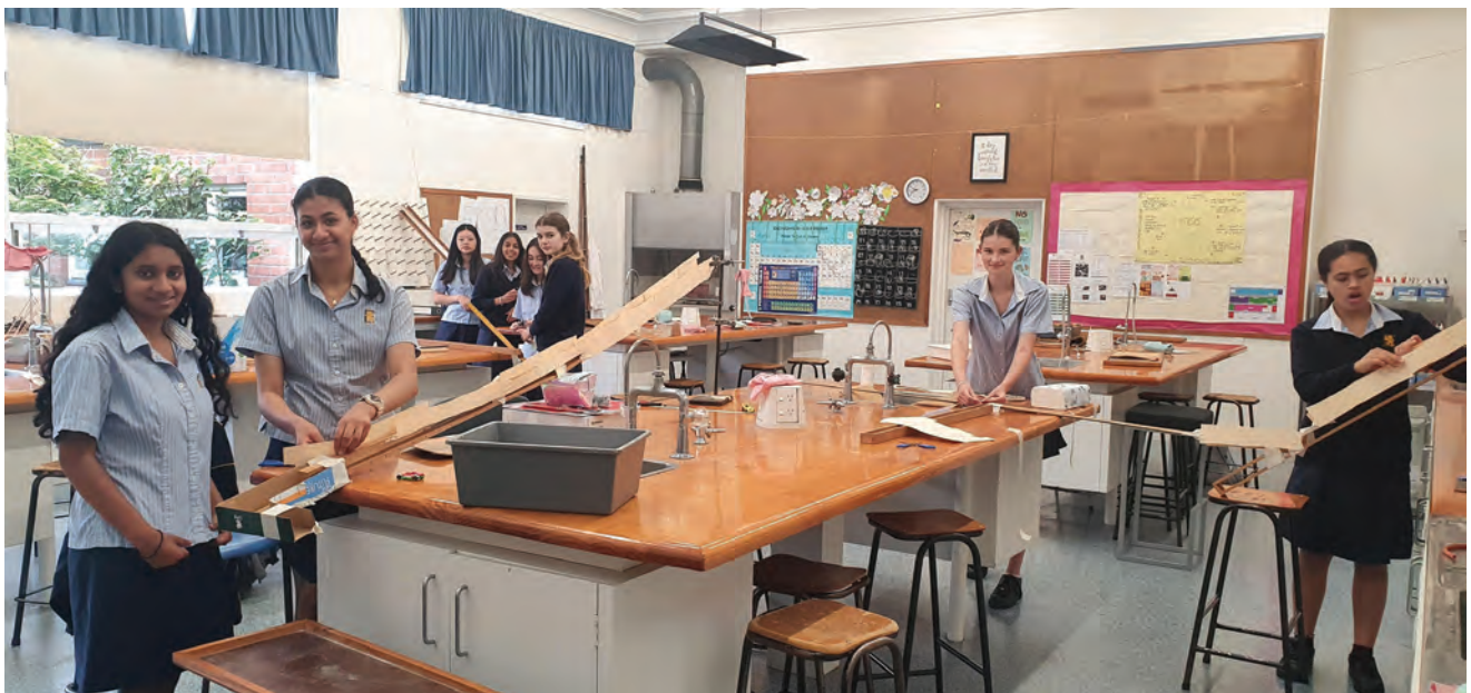
Year 10 Science doing some fun forces and motion experiments.