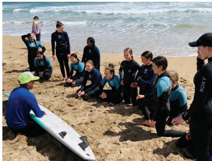
Year 10 Camp - Pataua South (article on page 6)

Tēnā koutou parents, caregivers and students,