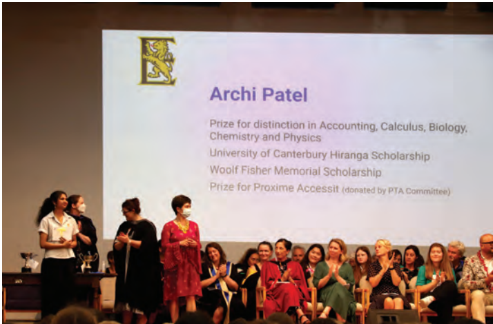
► Click here to view the 2022 Senior Prizegiving

knowledge, guidance and support to the shape of events within our kura in order to support the principles of Te Tiriti o Waitangi and uphold the unique place that Māori have in Aotearoa New Zealand and this kura as tangata whenua. This new role will be supported by other ākonga Māori leaders, Community EGG leaders and the wider Ka Hikitia team.