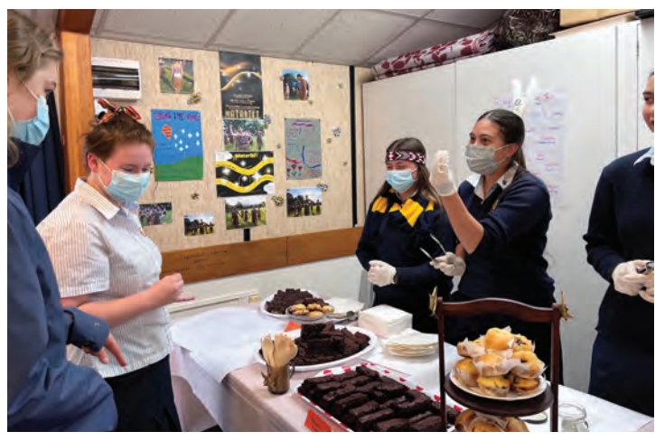
Kōrero Māori Cafē (see more photos on page 2)

Ngā mihi o te wā nei, arā, i Te Wiki o Te Reo Māori. Greetings to you all at this time, being Māori Language Week 2022. This week is extra special because the 14th of September marks the 50th anniversary of the Māori Language Petition, an event that led to many of the kaupapa we have today, including Te Wiki o Te Reo Māori. What kupu (words) did you learn this week? Below are some that are widely used in our school. See how many you know. Tune in next week for the answers!