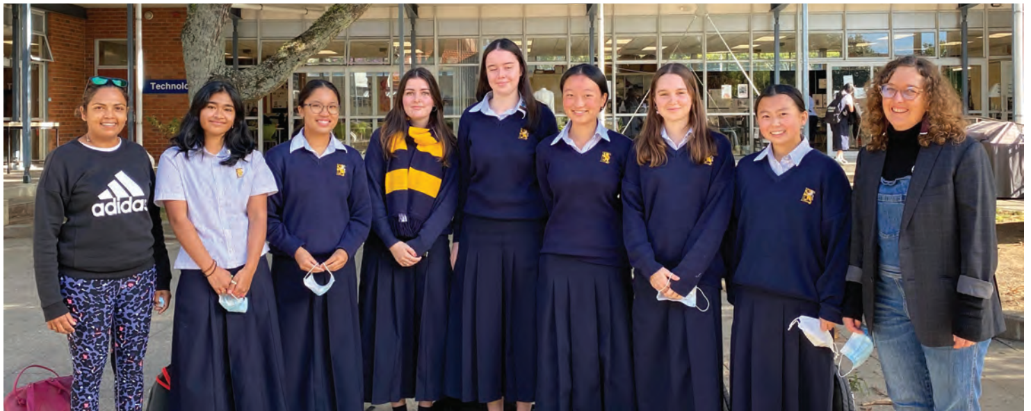
The Sustainability Committee

“The Sustainability Committee’s mission is to encourage meaningful action for the environment and continue our EnviroSchool silver journey. The Sustainability Committee fully supports the EGGG Foundation Solar Project as a learning experience for students”.