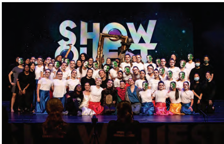
EGGS wins national final of ShowQuest 2022 (read article on page 8)