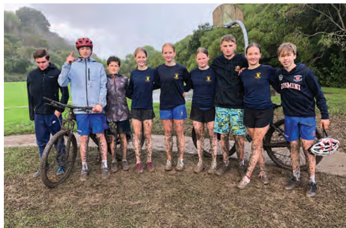
Get to Go Challenge - Mixed Premier team heading to the finals in December (read article on page 11)