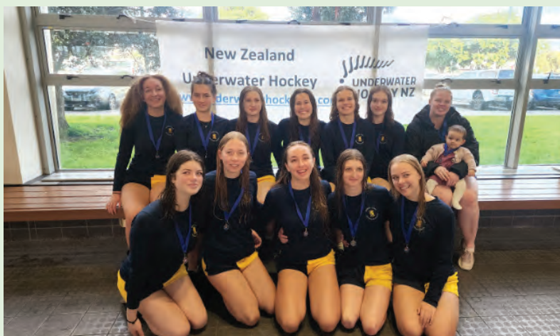
Senior A, Silver Medalists