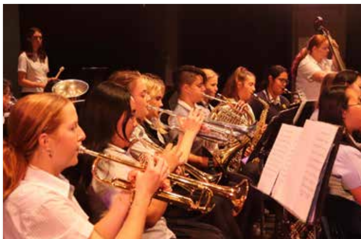
Epsom Bands Showcase held at the end of May