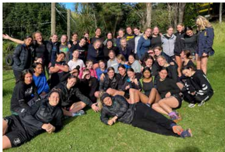
Year 12 Sports Science at Motutapu Outdoor Camp