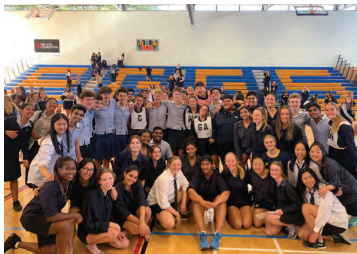
Campaign Week final day - Prefect's Dance and the AGS/EGGS Netball game