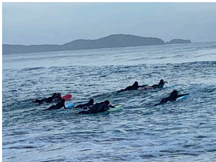
Year 11 Sports Science surf trip to Pataua North