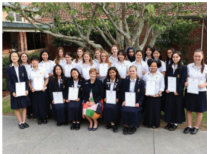
On Thursday morning 25 February Scholars' Awards were presented to students for their outstanding achievement in NCEA in 2020 which you can view here .