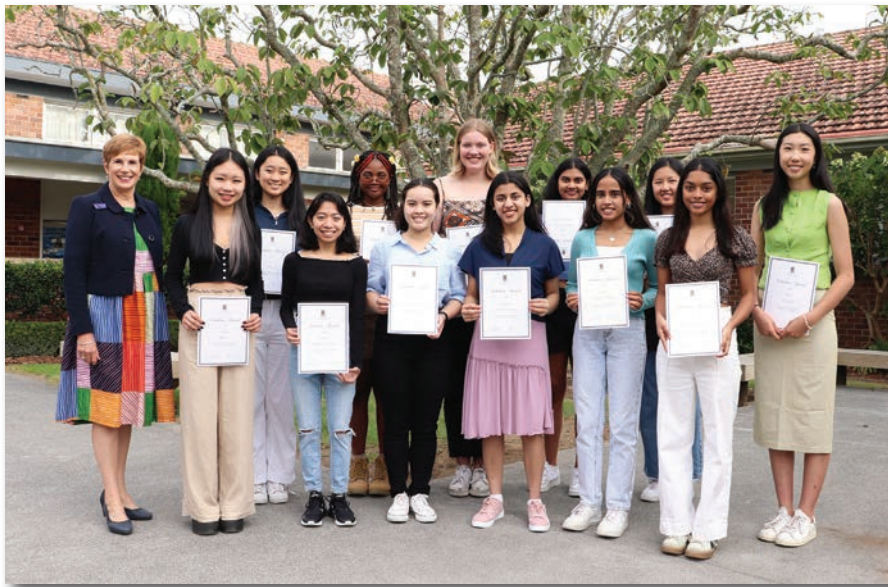
Year 13, 2020 Scholars