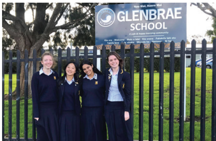
Learning & Community EGGS annual Pens and Pads Drive - see page 4