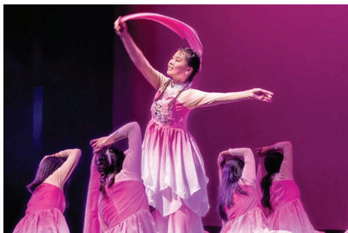
2021 Chinese Extravaganza

Last weekend's Chinese Extravaganza was a wonderful showcase of the talents of students from EGGS and AGS. Congratulations to everyone involved and their Teachers in Charge.