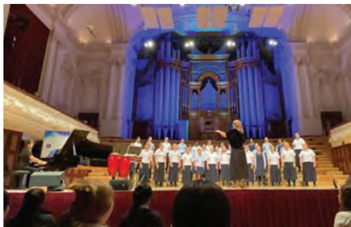
Paradisum performing at the Big Sing