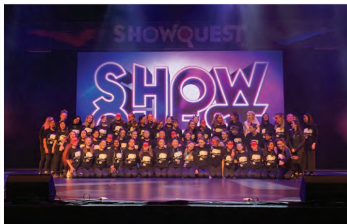
Congratulations to the Show Quest 2021 team on their outstanding performance on the 1st July at the Aotea Centre.

It has been wonderful to see so many families at the Subject Teacher Interviews over the last two weeks. With missing this opportunity last year, this connection has been very important.