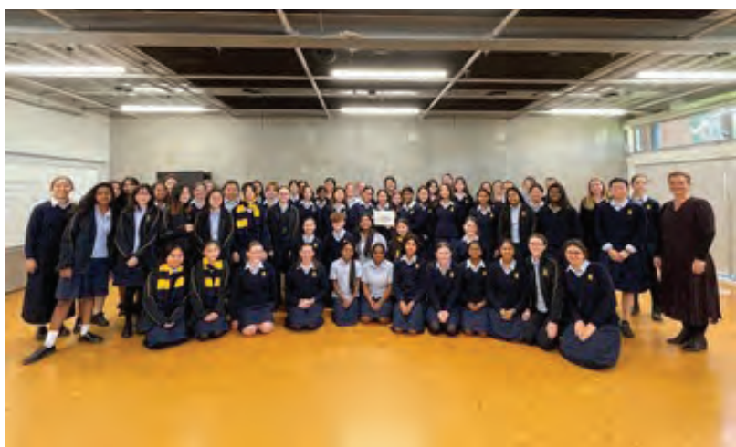
Canto Vivo group photo with their runner-up best junior choir