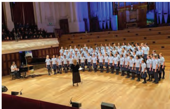
Canto Vivo performing at the Big Sing