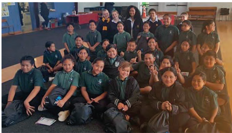
Year 12 Health Sociology visiting Southern Cross Campus Junior School in Mangere