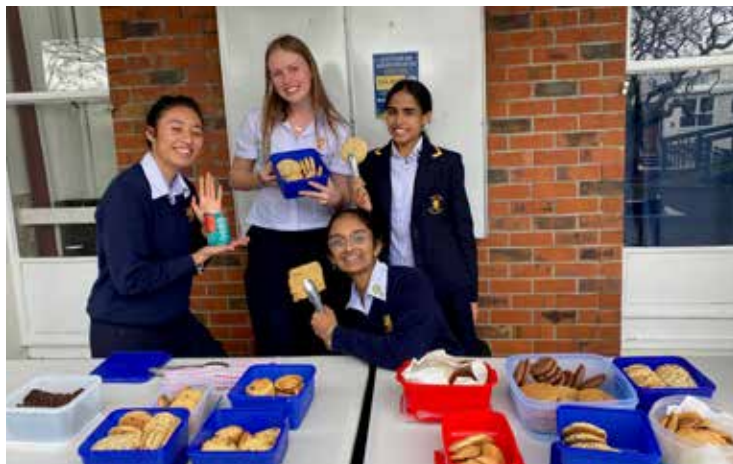
Community EGG - Can for a Cookie