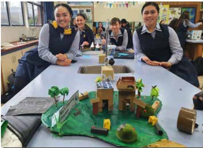
Environmental Science students proud of their conservation reserve model for an endangered native species. This one is for the long tailed bat