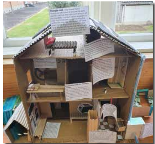
Building energy efficient houses in Year 9 Science