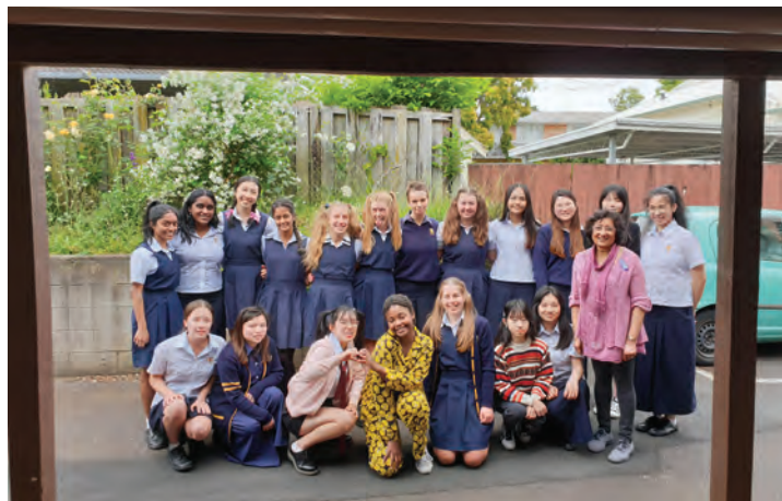
Year 13 Physics on their dress up day.