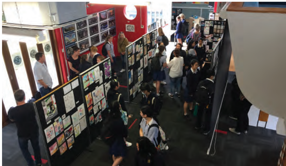
Year 11 Art Exhibition