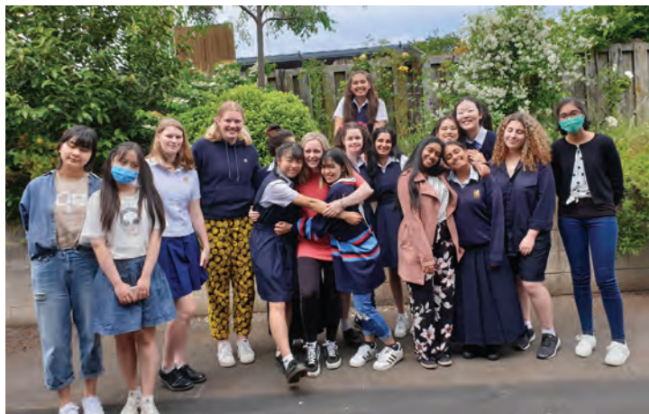
Year 13 Physics