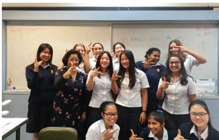
Year 12 Physics