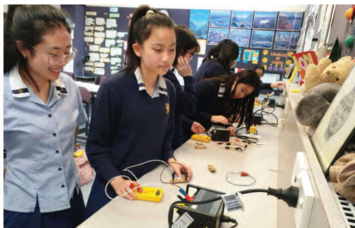
Year 11 Physics students doing some practical work in the lab.