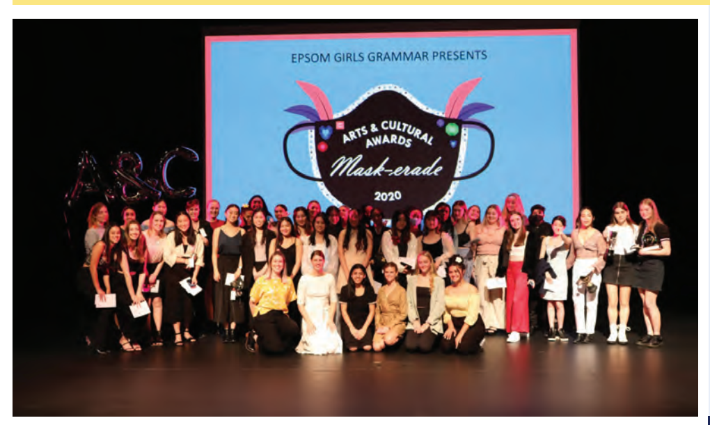
2020 Arts and Cultural Awards - more photos on page 4