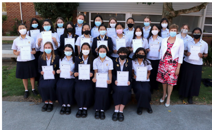
2021 Level 2 Scholars

On Tuesday 2 March we celebrated the achievements of our senior students from 2021 with our online Scholars Assembly. We also recognised the outstanding success EGGs has had in NZ Scholarship for 2021.