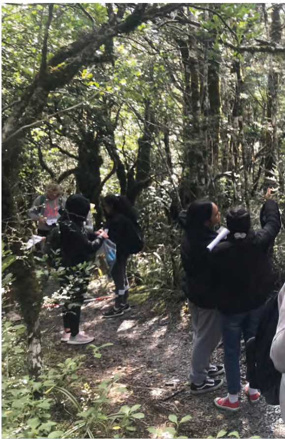
The Podocarp Forest, Ohakune

area. A drive to the end of Top of the Bruce Road, Mt Ruapehu gave an epic view of the ring plains and other mountains. Witnessing the construction of a new gondola line gave insights into how infrastructure is created and maintained to cater for the winter ski season. The students saw how development is managed and balanced with sustainability of Mt Ruapehu.