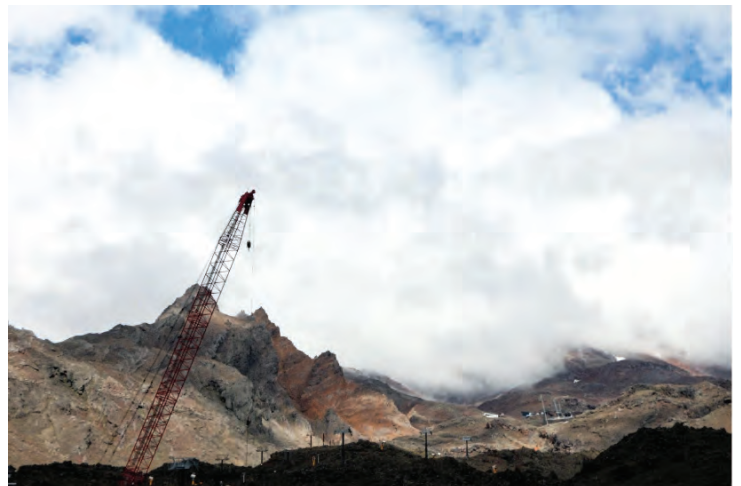
The new Gondola under construction, Whakapapa Ski Field