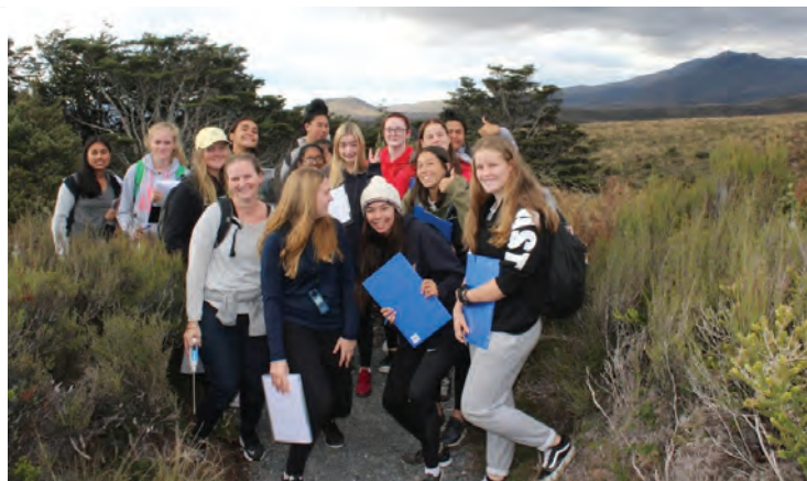
Year 12 Geography - Alpine Track, Mt Ruapehu