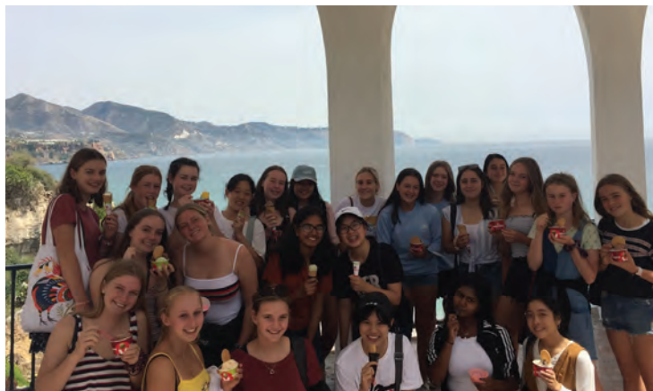
Tri nations trip - Students in Nerja, in the South of Spain