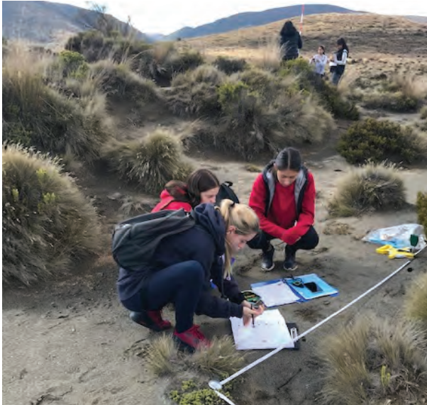
Data collection at the Rangipo Desert