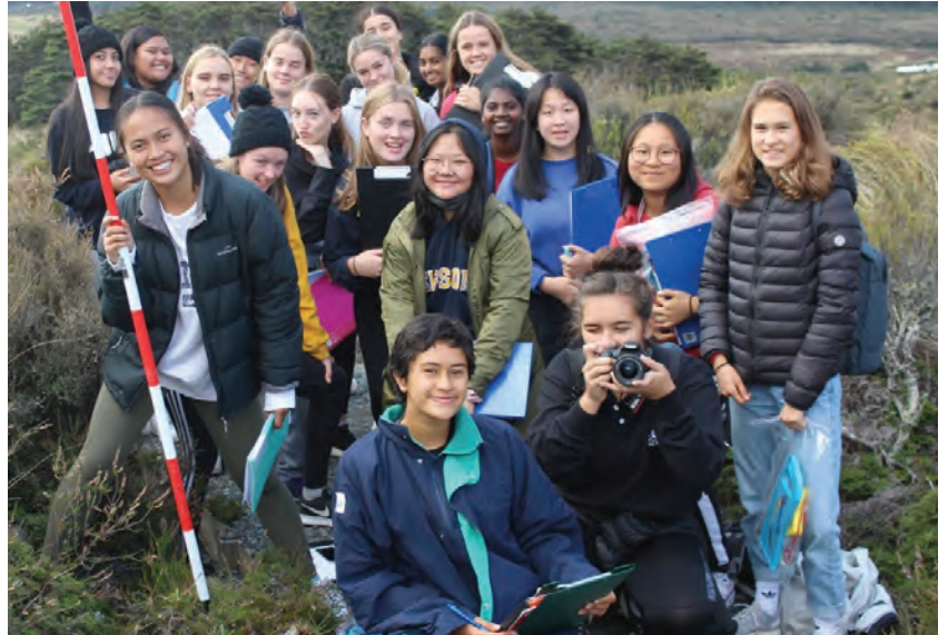
The Alpine Track, Mt Ruapehu, approx. 1800 m ASL