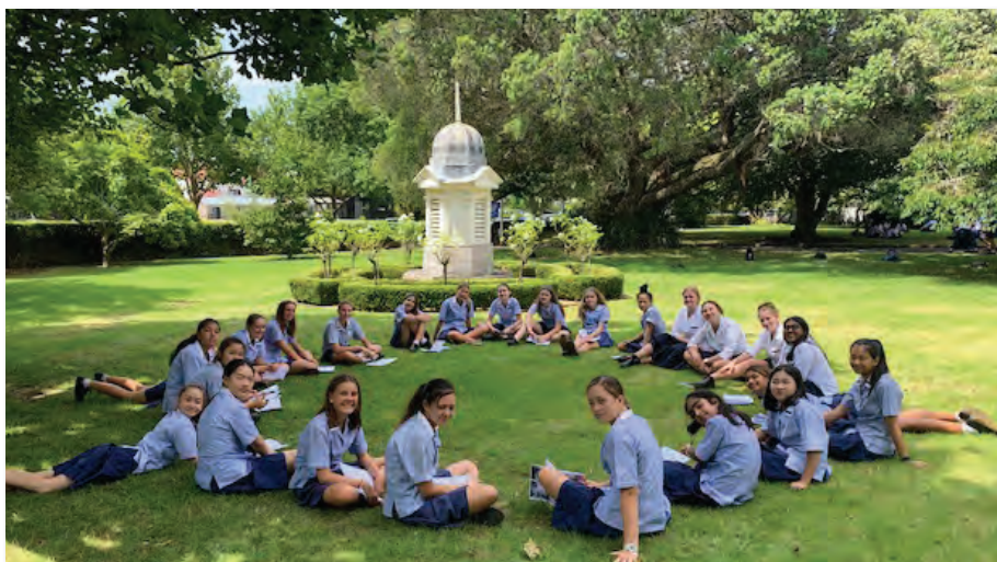
A Year 9 tutor group with their Peer Tutors on the first day of school for 2019