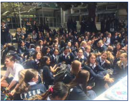
Some of the Prefect team at the final senior assembly held last week