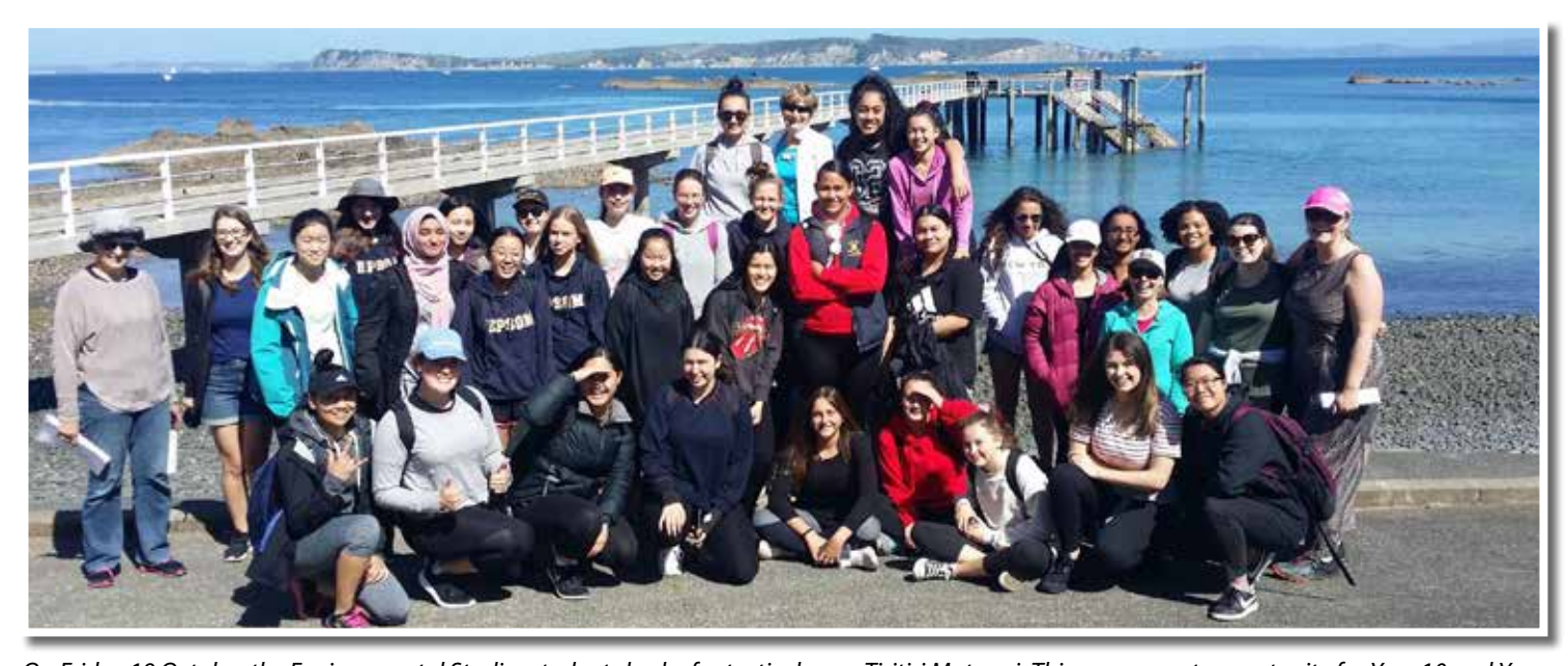
On Friday 19 October the Environmental Studies students had a fantastic day on Tiritiri Matangi. This was a great opportunity for Year 10 and Year 13 students to work together.