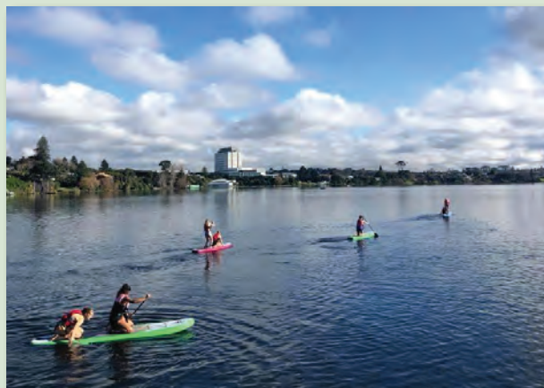
EGGS students taking part in the Auckland Get to Go Challenge held on 7 August - Orienteering, Mountain Biking, Stand Up Paddling and Problem solving