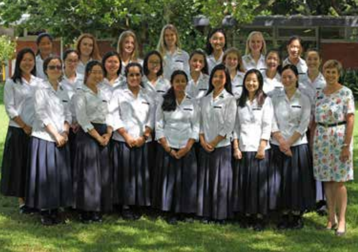
2017 Year 11 Top Scholars