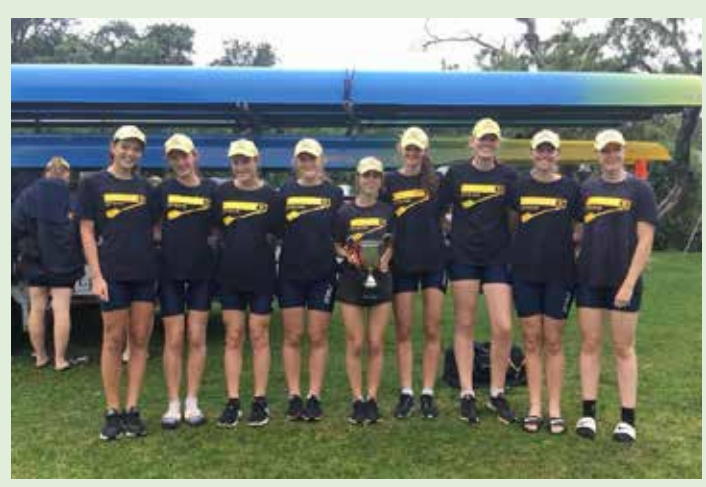
16 Senior Rowers also competed at the National Club Championships last week, representing Auckland Rowing Club. Rowing New Zealand did a write up of the outstanding result:

Auckland Rowing Club, comprising of the Epsom Girls Grammar School rowing crew, secured the highly-sought women's club coxed eight title in imperious fashion. The young group claimed a comfortable win in 6:45.90 – a little over seven seconds clear of Nelson Rowing Club