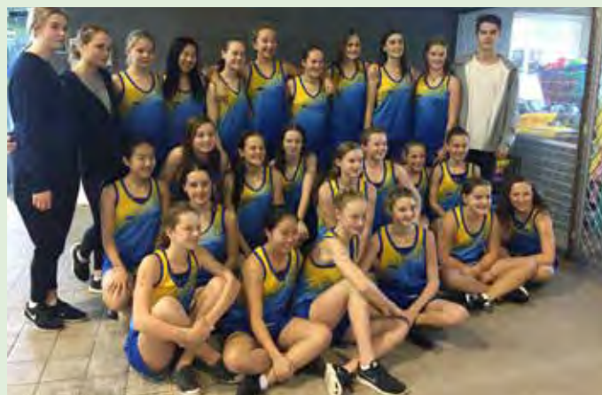
Full Junior Squad