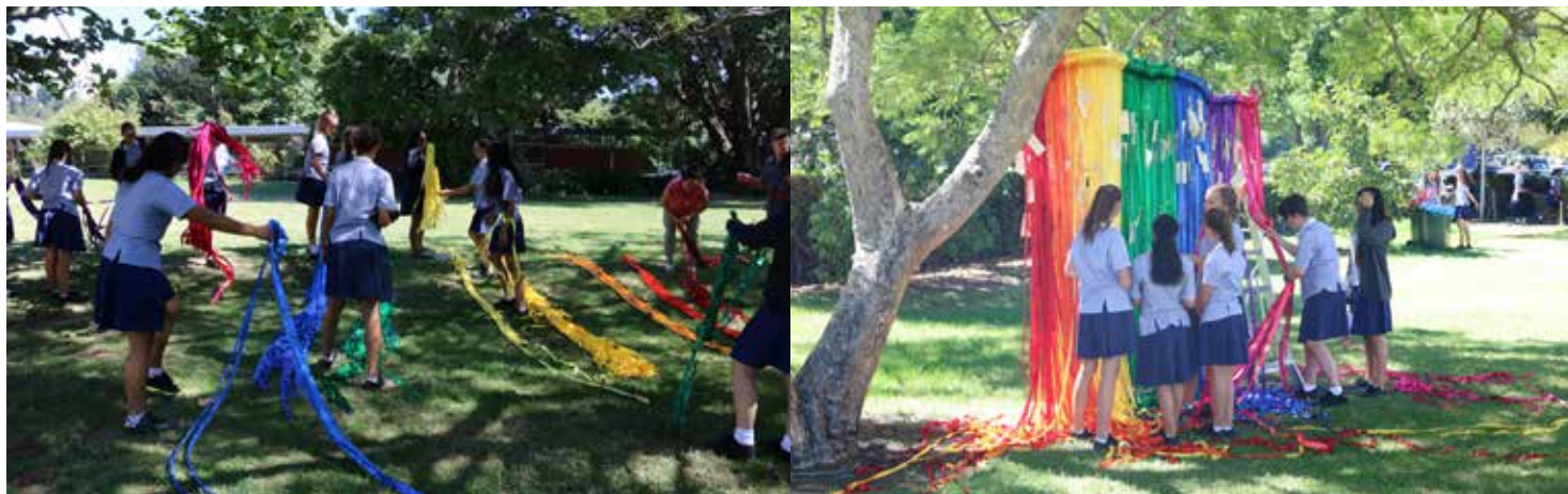
Ribbons for Christchurch