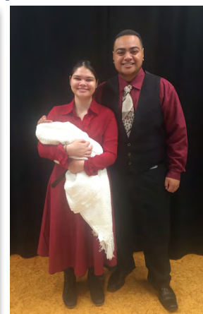
Some of the cast from 'Ragtime' who performed at assembly on Thursday 3 May.

The show presents a 'dream of what this country could be,' with the characters finding a way to live together as Americans, despite their differences. Though Ragtime takes place over one hundred years in the past, its exploration of immigration, race, tolerance and the power of the human spirit will resonate deeply with audience members in 2018.