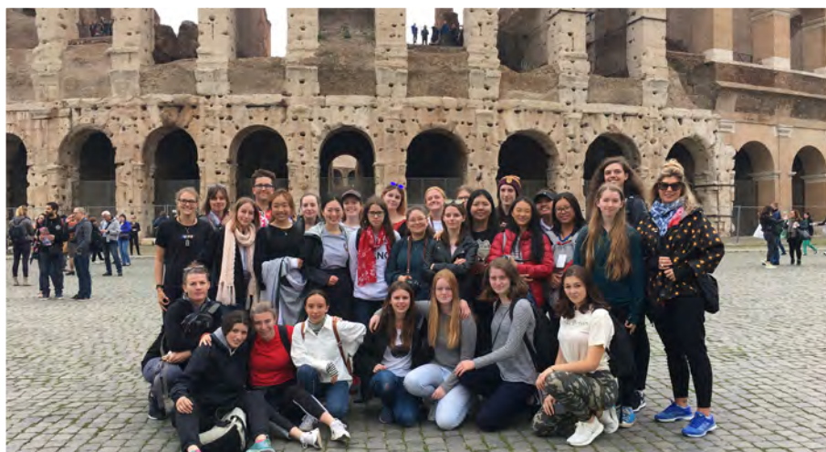
EGGS Grand Tour 2018