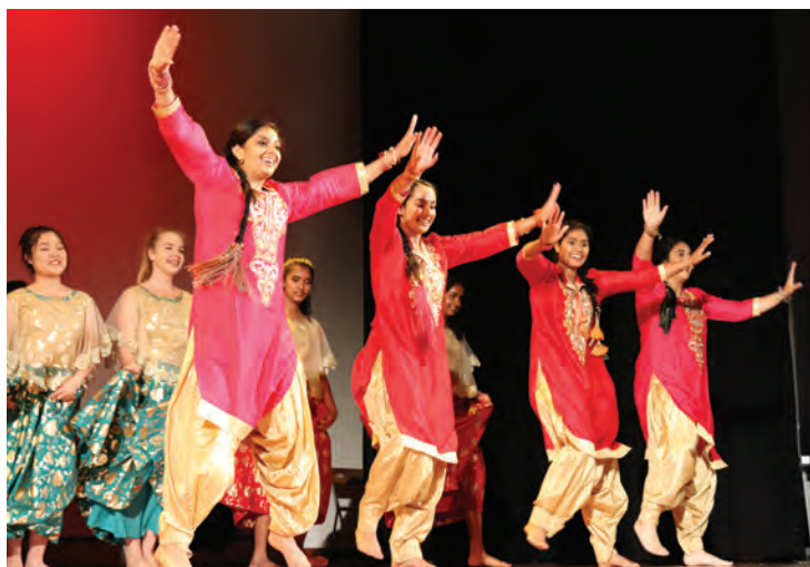
Fia Fia Night 2018