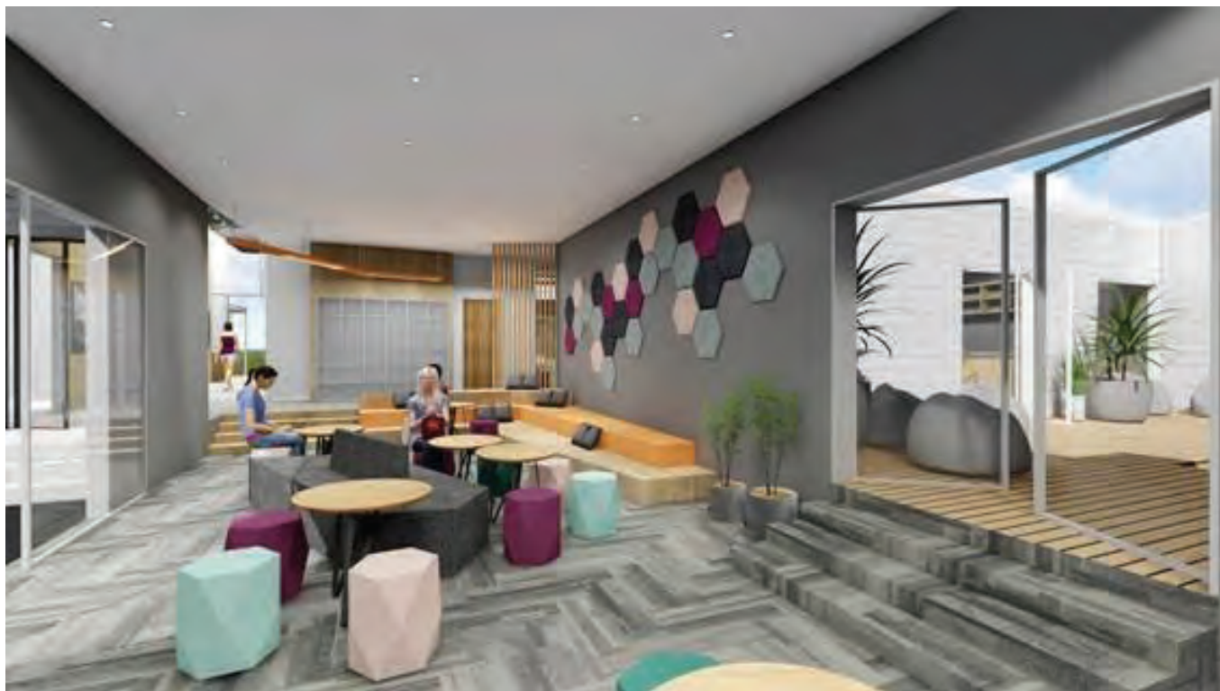
An image of the architecturally designed concept for the interior of the L Block

We're embarking on an exciting and innovative project this year and upgrading our L Block into a flexible learning environment to keep pace with the needs the EGGs community. Learning is the heart of this project.