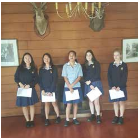
Year 9 and 10 students at Highwic House

Next Tuesday we finish the year with Junior Prizegiving. It has been a busy last few weeks with senior students doing their NCEA Examinations; with student leadership training following the exams and a whole raft of activities for the Year 9 and 10 students, including the Ki o Rahi Tournament and Careers Day – more details in this edition of EGGNEWS.