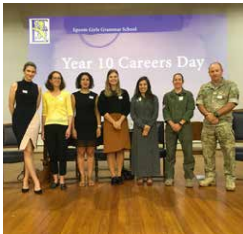
Year 10 Careers Day