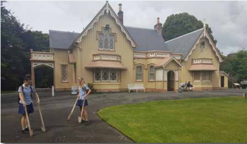
Students at Highwic House