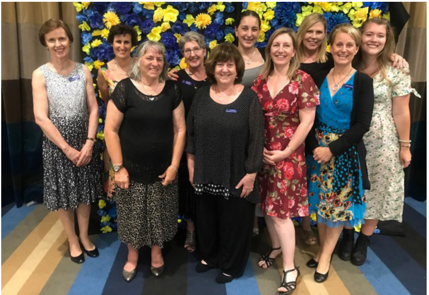
Members of the 2019 OGA Committee