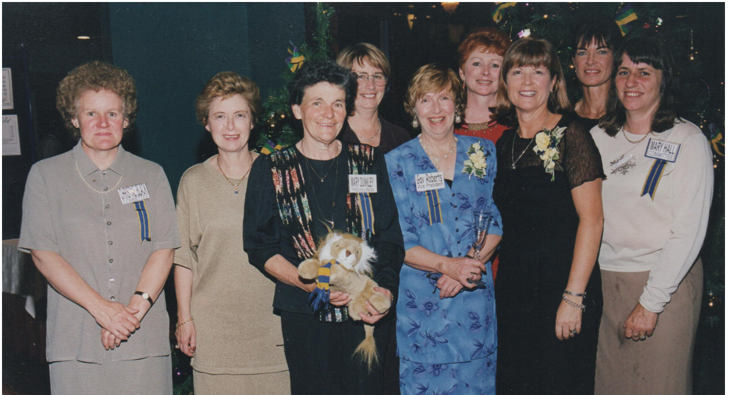
Members of the 1999 OGA Committee