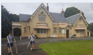
Students at Highwic House