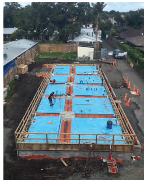
Epsom House POD 2 under construction

Meanwhile, Epsom House POD 2 construction is well underway with the floor slab poured in mid-March. The second POD replaces the Manuka accommodation block which was demolished in December last year. POD 2 is scheduled for completion in September and is expected to be occupied by students in Term 4.