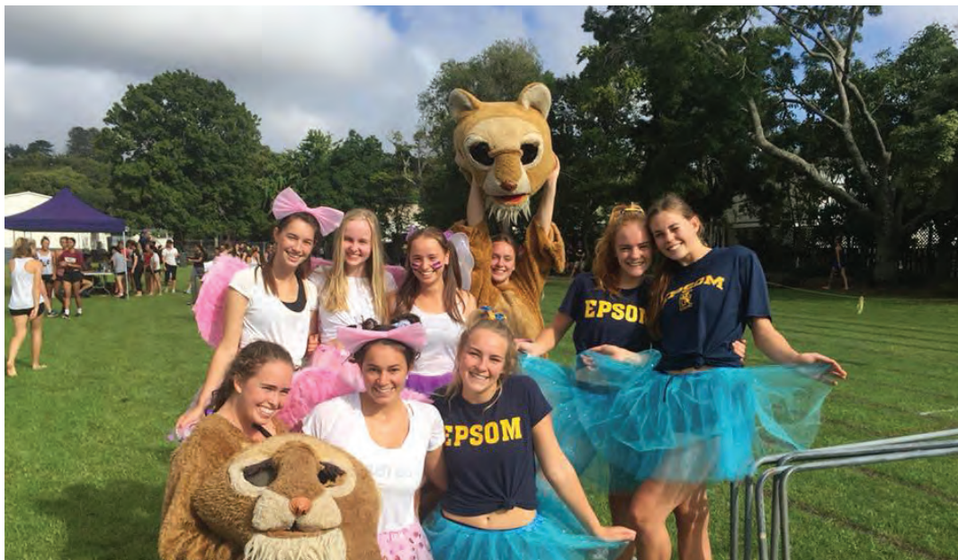
Athletics Day - February 2018

A message that came through strongly in the Survey feedback was for more news of "ordinary" Old Girls, as well as the wonderful high-flyers. Many EGGs students excel and achieve phenomenal success, but many more go on to enjoy full, fruitful and successful lives in their own ways, often under the radar. We endeavour to celebrate all EGGs alumnae and are always seeking inspirational and heart-warming stories. If you have a story about an "ordinary Old Girl doing extra-ordinary things" or, equally, an "extra-ordinary Old Girl doing ordinary things" (it may be you!), please do let us know!