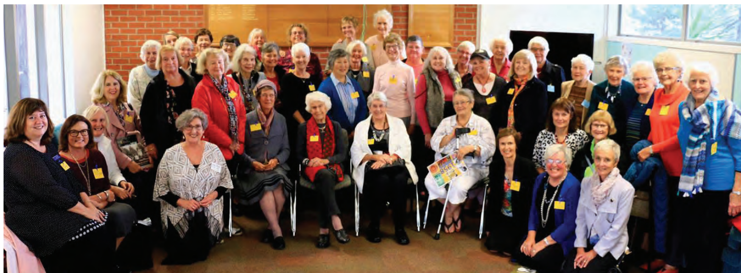
OGA Annual Morning Tea - April 2018