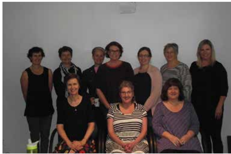
OGA Committee at the Strategic Planning Meeting