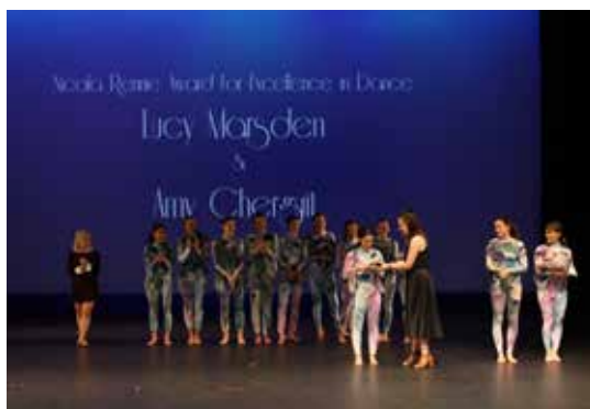
Nicola Rennie Award being presented