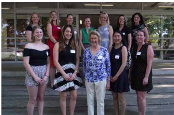
Kathleen Mandeno Scholarship winners reunion