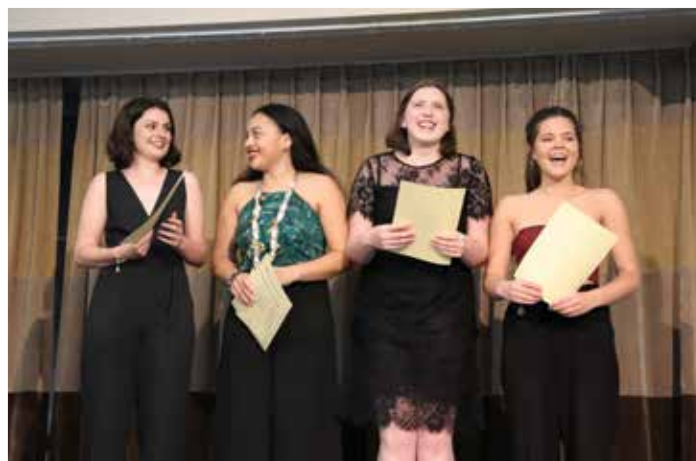
Year 13 Graduation Dinner