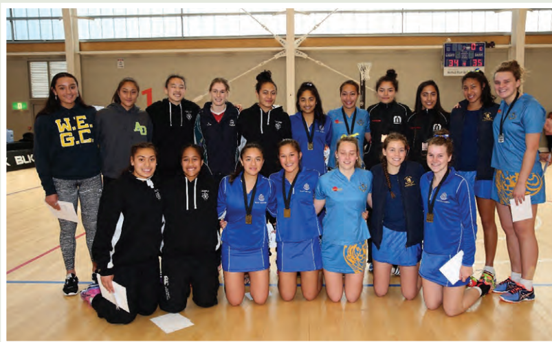
Netball Nationals 2016