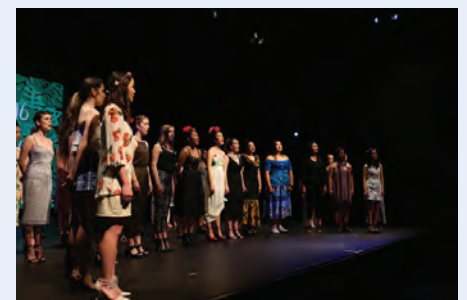
Arts & Cultural Awards 2016