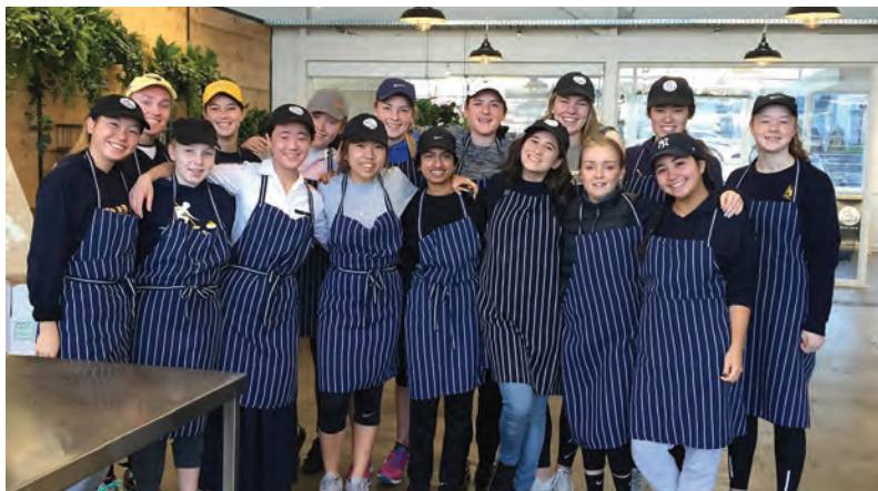
Some of the student volunteers at Eat My Lunch in August

Throughout August, 50 senior students volunteered for Eat My Lunch as part of the new volunteering group Outreach. Outreach aims to connect EGGs students with charities and organisations to volunteer for our local community. These students participated in packing thousands of lunches for kiwi kids in 33 decile 1 and 2 schools across Auckland and Hamilton. This was an extremely rewarding opportunity and all the girls loved being able to help children in need. Outreach will continue to partner with Eat My Lunch to volunteer for 5 more weeks next term. To find out how you can volunteer or buy lunches to gift lunches to kids in need check out Eatmylunch.nz .