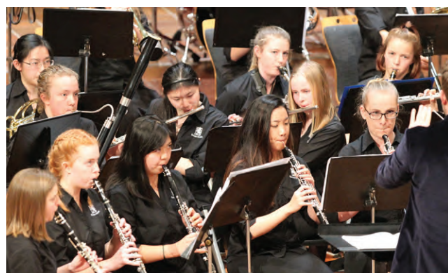
Epsom Concert Band performing at the KBB Music Festival where they won a Gold Award