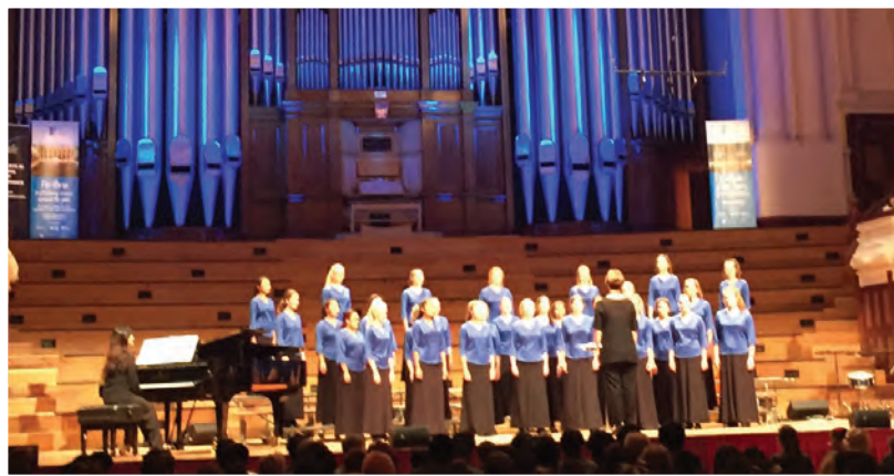
Paradisum on stage at The Big Sing Regional in Auckland → Click here to view Paradisum singing 'Gloria' at The Big Sing Finale in Dunedin