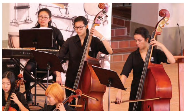
Members of the Epsom Symphonia performing at the KBB Music Festival where they gained a Bronze Award