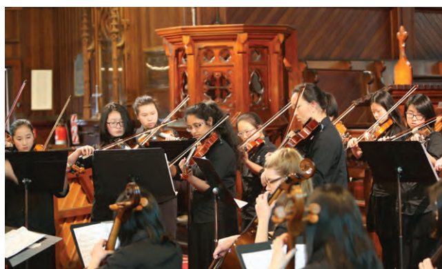
Epsom String Ensemble Band performing at the KBB Music Festival where they received a Certificate of Participation