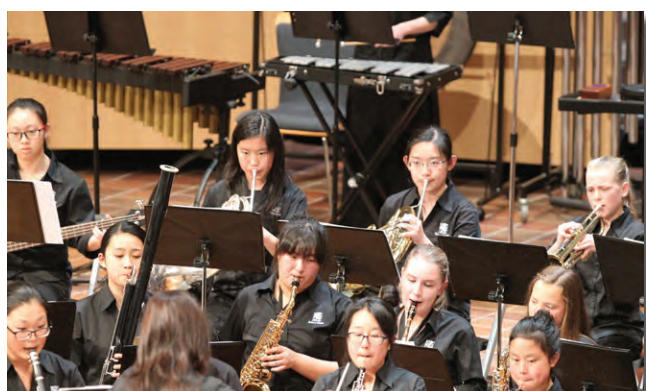
Epsom Intermediate Concert Band performing at the KBB Music Festival where they won a Bronze Award