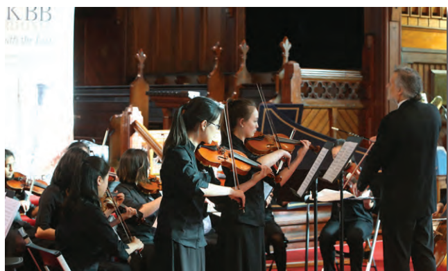
Epsom Chamber Orchestra performing at the KBB Music Festival where they received a Gold Award and an invitation to play at the Gala Concert