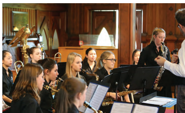
Epsom Stage Band performing at the KBB Music Festival where they gained a Bronze Award